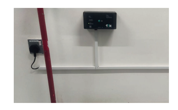
TTK custom-built FG-A kit panel installed on site