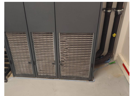
TTK water sense cable installed around critical equipment