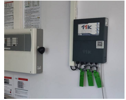
TTK FG-NET panel installed on site

In the event of a leak, the FG-NET panel displays the location on its touch screen with pinpoint accuracy, down to 1 meter. It also drives dynamic drawings on the BMS, which can be simultaneously viewed on screens in the central building control room.