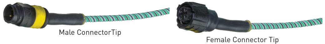
Male Connector Tip